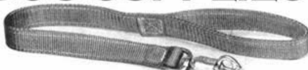
QUICK RELEASE DOG LEADS DOUBLE PLY 1" x 1' # 96 1" x 2' # 97