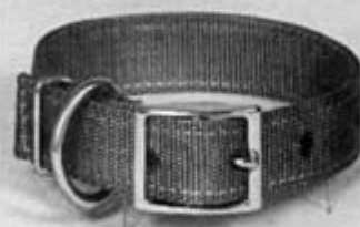
3/4" DOG COLLAR DOUBLE PLY 3/4" TO 14" # 62 3/4" TO 16" # 63 3/4" TO 18" # 64