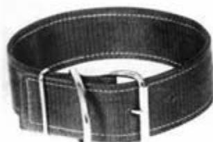
2" DOG COLLAR DOUBLE PLY 2" TO 22" # 7322 2" TO 24" # 7324 2" TO 26" # 7326 2" TO 28" # 7328