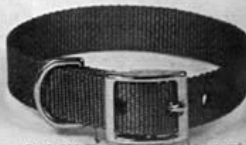
3/4" DOG COLLAR SINGLE PLY 3/4" TO 12" # 65 3/4" TO 14" # 66 3/4" TO 16" # 67 3/4" TO 18" # 68