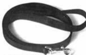
3/8" DOG LEADS SINGLE PLY 3/8" x 4' # 102 3/8" x 6' # 103