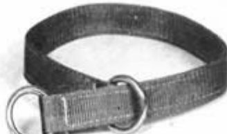
CHOKER COLLAR DOUBLE PLY 1" TO 22" # 56 1" TO 24" # 57 1" TO 26" # 58 1" TO 28" # 59 1" TO 30" # 60