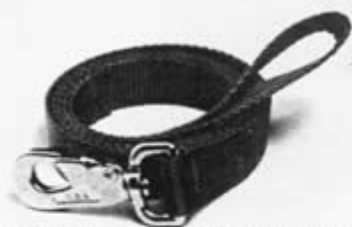
DOG LEADS SINGLE PLY 1" x 2' # 92 1" x 4' # 93 1" x 6' # 94