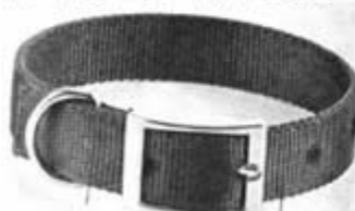
DOG COLLAR DOUBLE PLY 1" TO 18" # 46 1" TO 20" # 47 1" TO 22" # 48 1" TO 24" # 49 1" TO 26" # 50