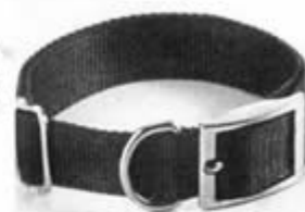
ADJUSTABLE COLLARS 1" x 14" TO 24"