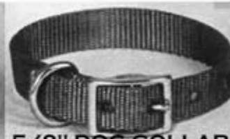
5/8" DOG COLLAR SINGLE PLY 5/8" TO 10" # 69 5/8" TO 12" # 70 5/8" TO 14" # 71 5/8" TO 16" # 72 5/8" TO 18" # 73