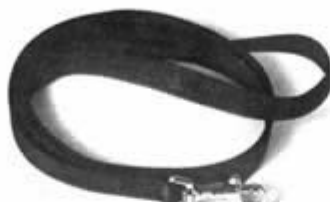
5/8" DOG LEADS SINGLE PLY 5/8" x 4' # 100 5/8" x 6' # 101