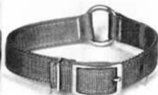
RING COLLAR DOUBLE PLY 1" TO 18" # 51 1" TO 20" # 52 1" TO 22" # 53 1" TO 24" # 54 1" TO 26" # 55